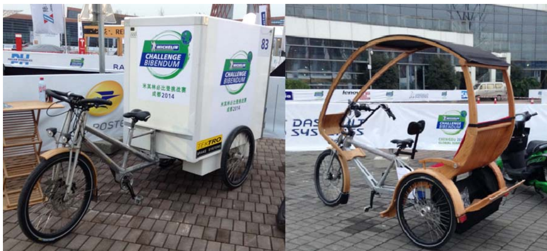
Electric tricycles for logistics and passengers