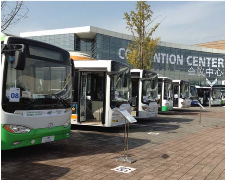
Buses at the MCB

There are two awards given from the City Bus Rally: electric bus category and ICE (internal combustion engine) category. Winner of the electric bus category is Yutong E7, as shown below.