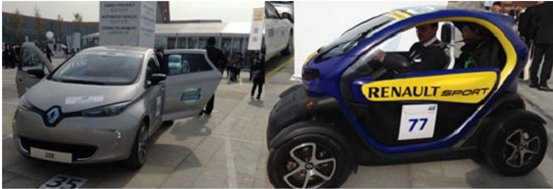
Renault Zoe (five door electric car) Renault Twizy (two passenger electric car)