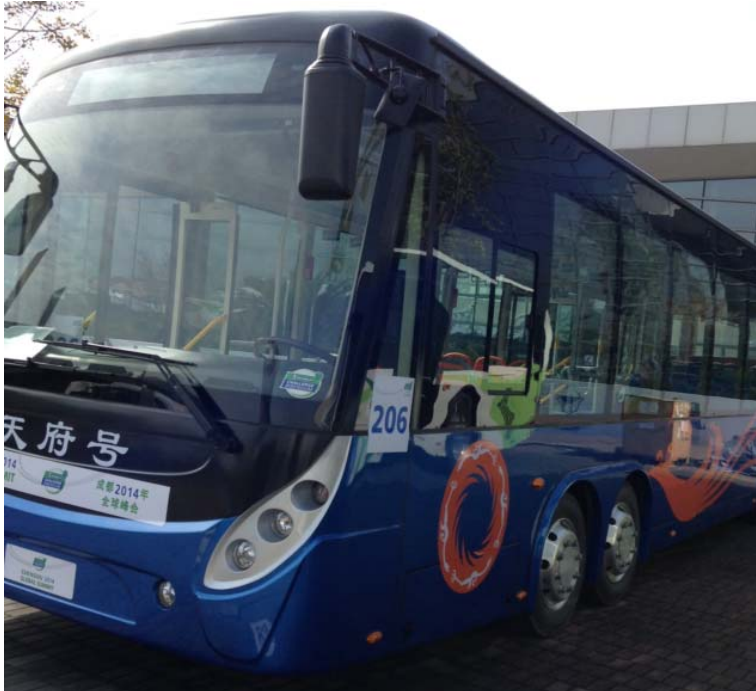
Electric Bus Winner - Yutong E7

There are two awards given from the City Bus Rally: electric bus category and ICE (internal combustion engine) category. Winner of the electric bus category is Yutong E7, as shown below.