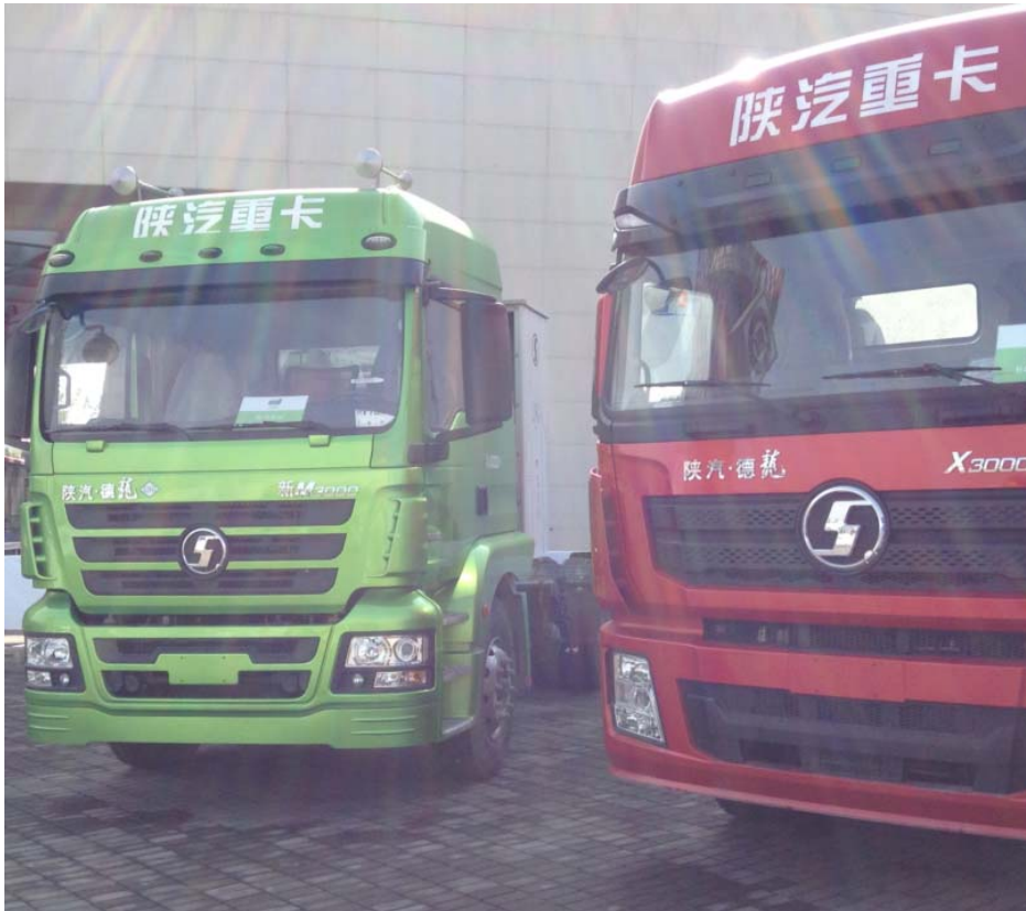
LNG powered HGVs at MCB

Different from the number of bus manufacturers in the MCB, only one HGV manufacturer, SHACMAN, presented its HGV in the MCB. The two HGVs, D'Long M3000 and X3000, were LNG powered.