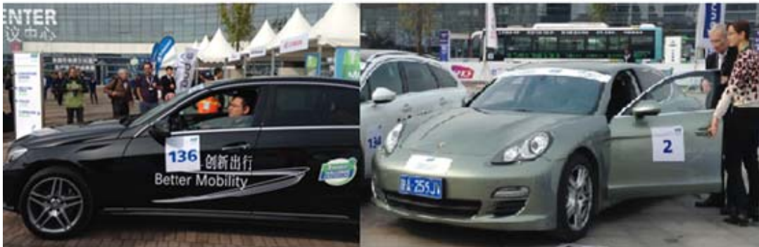
Mercedes E400L Hybrid